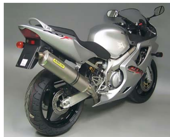
FULL SYSTEM HIGH VERSION