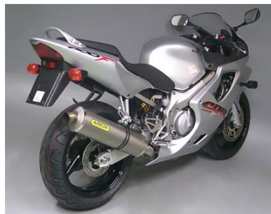
SILENCERS KIT LOW VERSION