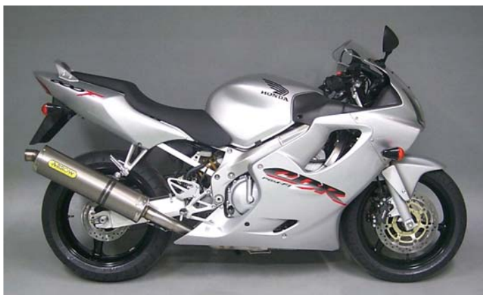
KIT TERMINALE VERSIONE BASSA