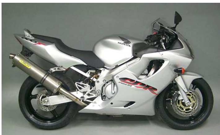
KIT COMPLETO VERSIONE ALTA